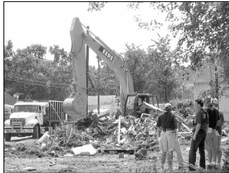
Day one of the Extreme Makeover build saw the small, two-bedroom house demolished in a matter of hours.