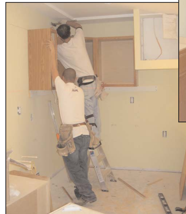
Workers install new kitchen cabinetry.

In 2008, HADC pledged its assistance to the Dunbar by agreeing to supply all appliances to the project. A