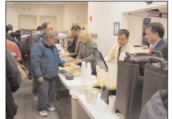
Board Members of Home Builders Care Foundation work the buffet line and serve dinner to shelter residents.

During the evening, a special honorary award