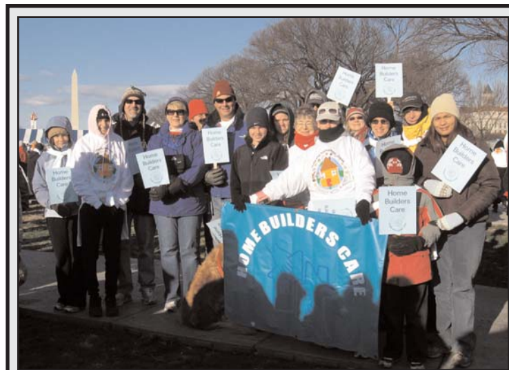
Walkers for Home Builders Care – Cheers to those who braved the cold and crowds at the 2008 Help the Homeless Walkathon on Saturday, November 22 on the National Mall in Washington, DC. More than $30,000 is expected to be raised through the Fannie Mae sponsored event for HBCF.